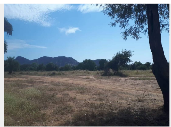
Kush State University was recently granted 30 acres in Kauda for its campus!

Take a look at <a href="http://sudansunrise.org/projects/kush-state-university/">http://sudansunrise.org/projects/kush-state-university/</a> to learn more, and see videos of KSU. Please write us at <a href="mailto:info@sudansunrise.org">info@sudansunrise.org</a> if you would like to know how you can help.